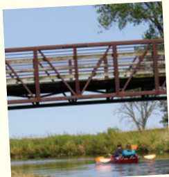
Scull and Oars Canoe and Kayak Rental