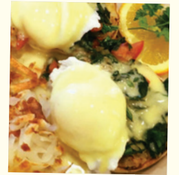
Café 31 North

The historic residential district in Elgin is made up of a number of Painted Lady, Victorian style homes and Sears homes. See why filmmakers come to Elgin to put a classic feel into their productions. Walk through historic downtown Elgin at your own pace to explore the architecture of these historic buildings. Follow along digitally and enjoy curated audio for each spot on the tour. After all that walking, it's time for a treat to cool off. The Milk House in Pingree Grove is a perfect spot. Locals voted this as their number one spot to get a refreshing treat last summer, and even more recently Milk House was inducted into the Illinois Makers program because of their dedication to providing farm-fresh ingredients with a spark of creativity that's hard to find elsewhere. Treat yourself to a handmade waffle cone or try out a number of flavors with an ice cream flight! Mockingbird Bar & Garden creates a unique dining experience with their incredible outdoor patio and small plates prepared in the wood burning oven. Experience a fresh, handcrafted cocktail with your meal while you perhaps sit fireside to enjoy each other's company into the evening.