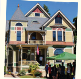
Historic residential district in Elgin