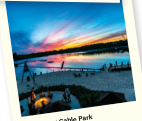
The Quarry Cable Park