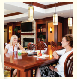
Hampton Inn McHenry

Many attractions have reopened with limited capacity or different operating hours. Inquire with attractions ahead of time for up-to-date travel policies and health and safety information.