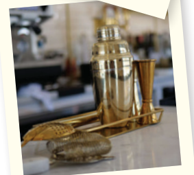
Mockingbird Bar + Garden