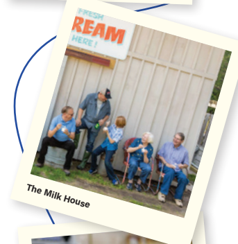
The Milk House