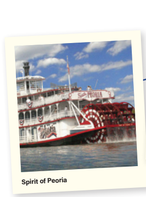
Spirit of Peoria