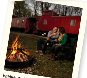
Wildlife Prairie Park Lodging