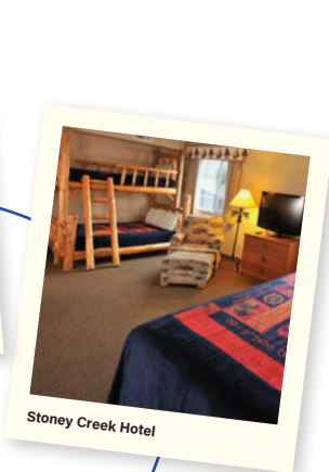
Stoney Creek Hotel

Many attractions have reopened with limited capacity or different operating hours. Inquire with attractions ahead of time for up-to-date travel policies and health and safety information.