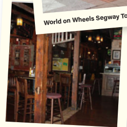
Kelleher's Irish Pub and Eatery