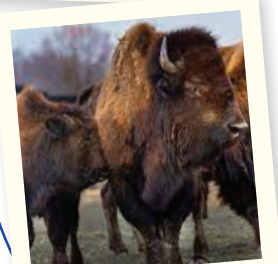
Wildlife Prairie Park