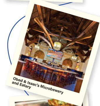
Obed & Isaac's Microbrewery and Eatery