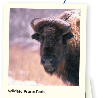
Wildlife Prairie Park

After your long day of traveling back in time, continue that journey by heading to Obed & Isaac's Microbrewery and Eatery located in a historic restored 1889 church. With a diverse menu and full, locally made beer list, there is something everyone can enjoy.