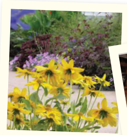
Luthy Botanical Gardens