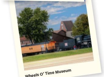
Wheels O' Time Museum