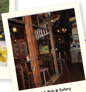
Kelleher's Irish Pub & Eatery