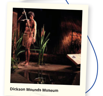
Dickson Mounds Museum