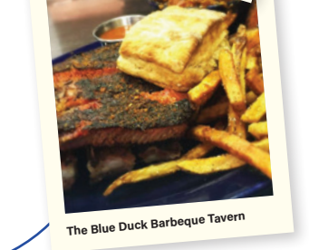
The Blue Duck Barbeque Tavern